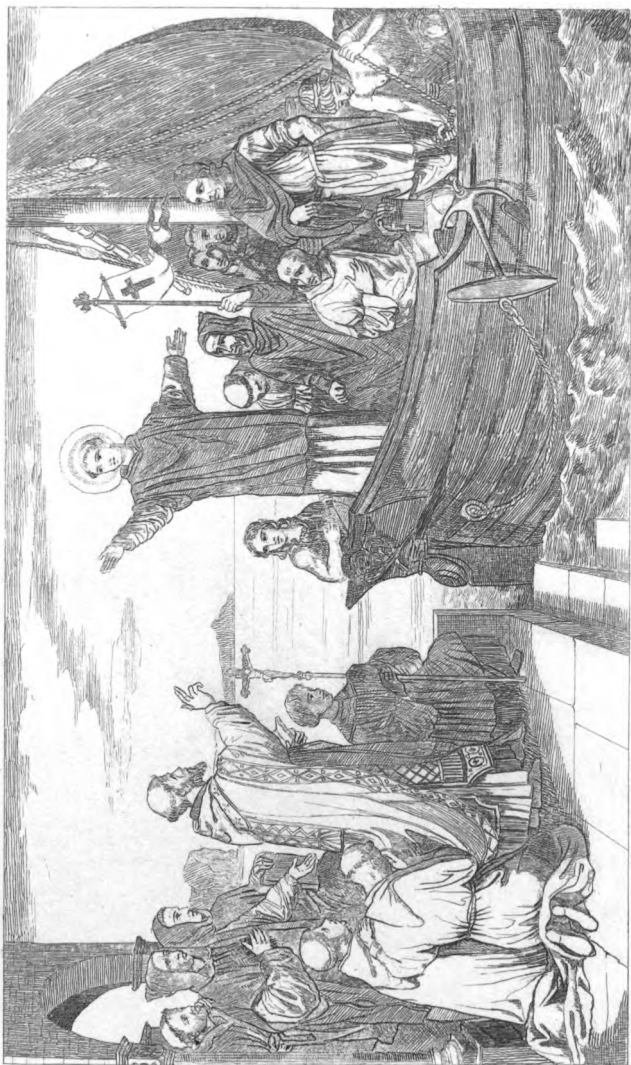
St. Boniface embarks at Southampton.